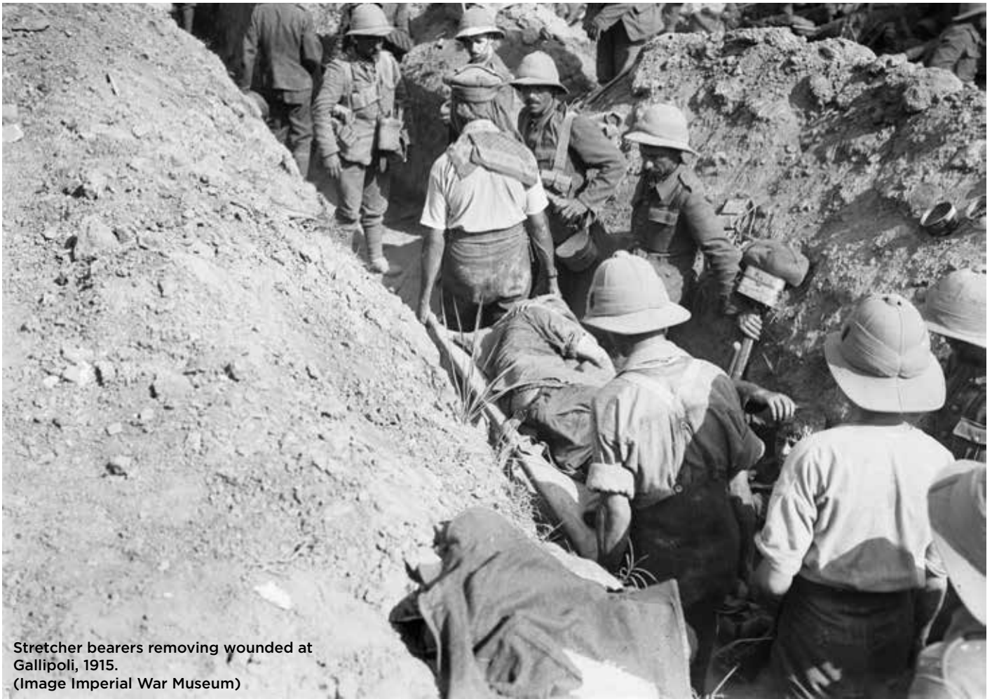
Stretcher bearers removing wounded at Gallipoli, 1915.

advanced foothold and the Auckland's old half-way position at the Pinnacle. The 6th Leinster occupied the Apex. In other words it was the Loyal North Lancashire and not the Leinsters who were at the Pinnacle when the Turks attacked. This is made clear by one of Bean's maps which shows the Pinnacle and the Apex on Rhododendron ridge occupied by the two units.